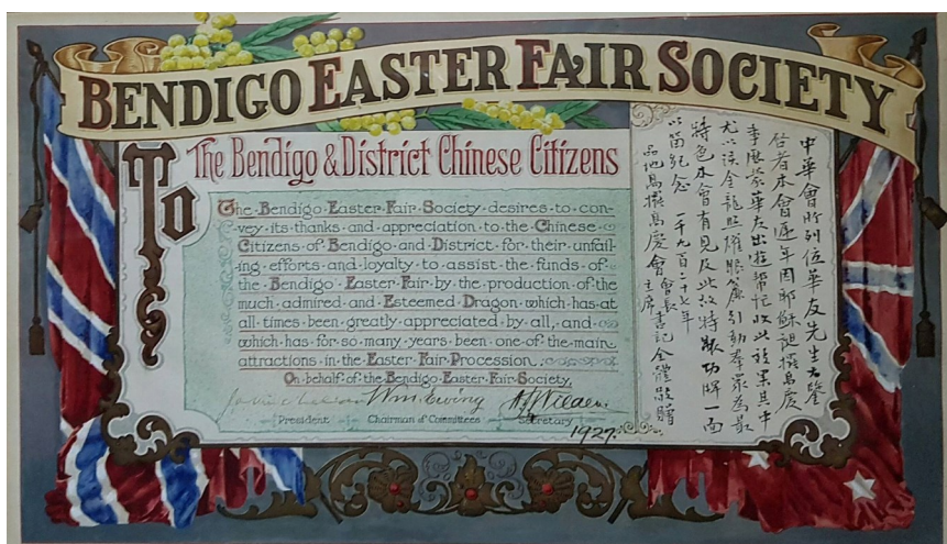
Presentation to Bendigo Chinese Association—1927