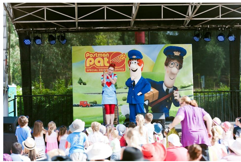
Postman Pat—Teddy Bear's Picnic-2012

We continue to plan for our 150th, bringing in the old and bringing in some new. What we have mentioned so far is only a small list of what we have planned. Some of what we have planned, we can't tell you as yet, as they are in the very early stages of planning. But we are super excited by them and hope you will be as well.