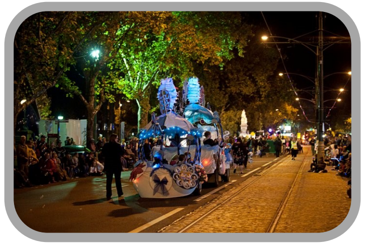
A float in the night parade—year unknown