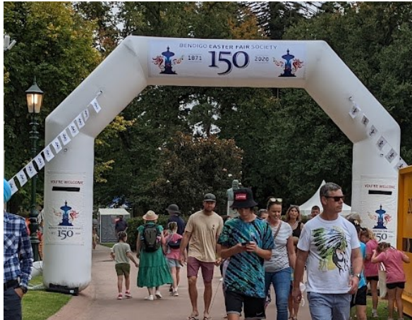
We will have our inflatable arch at the Lake.