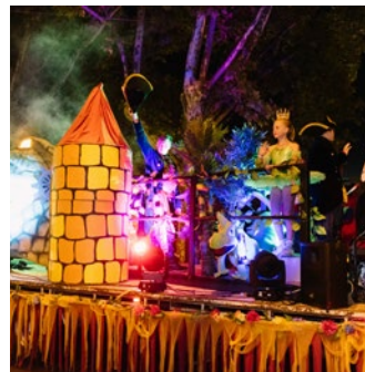
Fosterville Gold Torchlight Procession 7pm Fireworks to follow

6.30pm Pre-parade entertainment Transformers