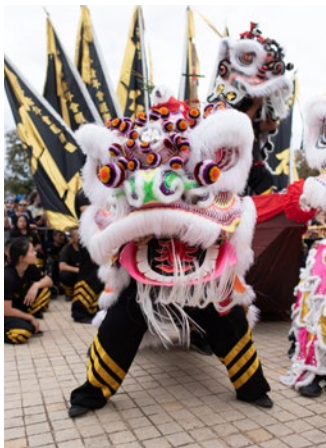
Return of the Dragon At the conclusion of the parade

9.30am – 11.30am, 3pm – 5pm Golden Dragon Museum