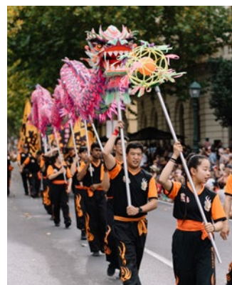
Bendigo Advertiser Gala Parade 12.30pm