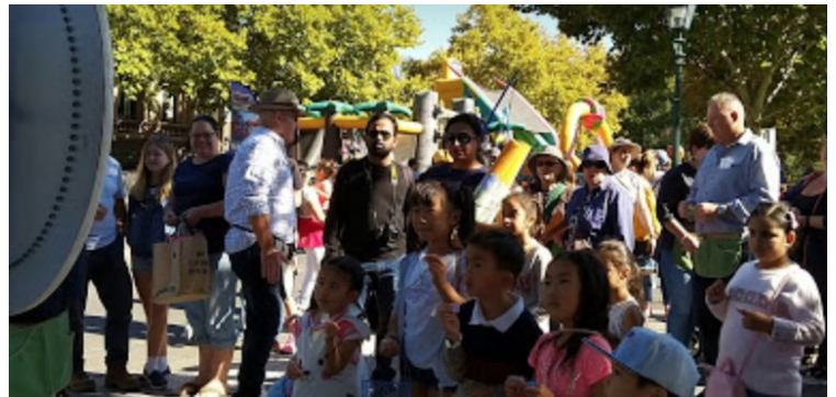
Spinning Wheel 2019