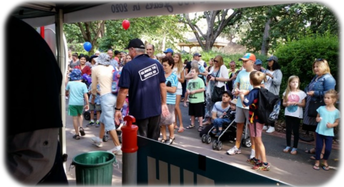
Spinning Wheel 2018