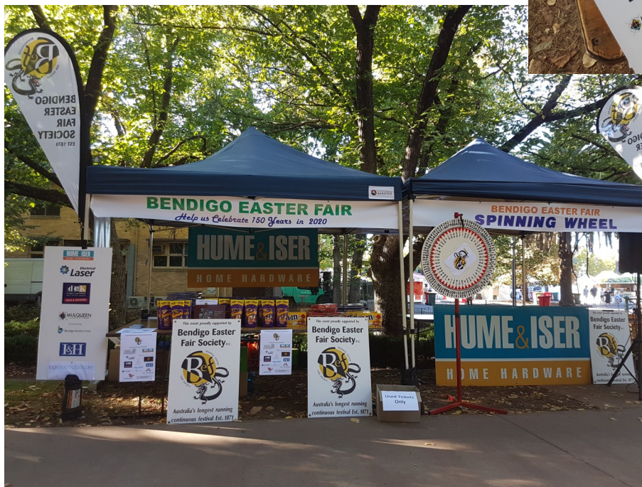
Spinning Wheel 2018