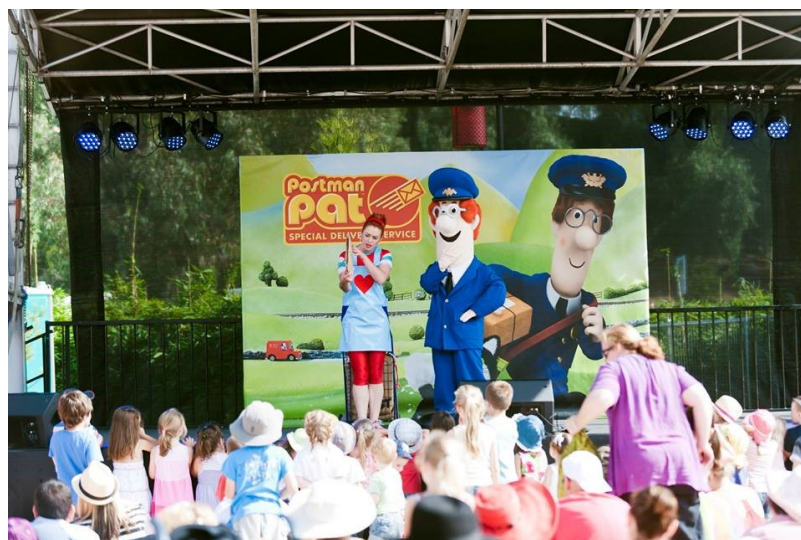
Postman Pat—Teddy Bear's Picnic-2012

We continue to plan for our 150th, bringing in the old and bringing in some new. What we have mentioned so far is only a small list of what we have planned. Some of what we have planned, we can't tell you as yet, as they are in the very early stages of planning. But we are super excited by them and hope you will be as well.