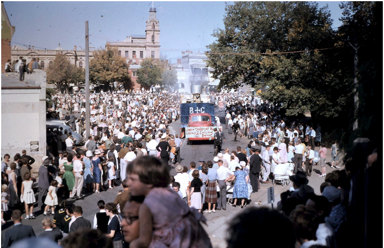
Watching the parade—year unknown but looks around the 1970's?

We will be set up in Rosalind Park near the Sidney Myer Place—bridge entrance. You can't miss us, we make a lot of noise. 😊