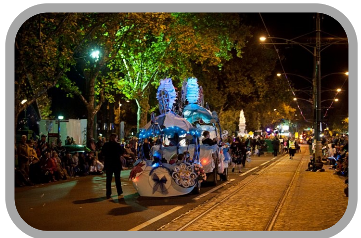
A float in the night parade—year unknown