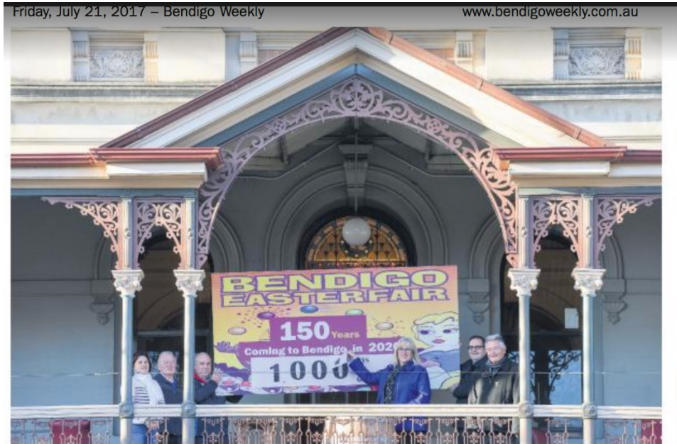
1000 DAYS: 2020 is set to be a big year for the Easter fair.

In these articles, we called onto the community members to share or donate their memorabilia, photos, and/or items of Easter that we could also use to help make our 150th even more spectacular. If you or anyone you know have anything you think we could use or wish to donate, please do not hesitate to email the Secretary on befs1871@gmail.com