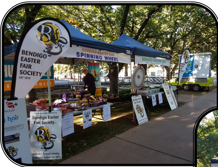
Setting up in the early morning before the crowds come.

We would also like to thank all the members and volunteers that helped to put on this event. Without their contribution, this would have been very difficult to make happen.