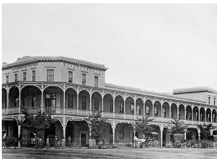
Shamrock hotel as it was in 1871

Over the past few months I have been doing a little research into the history of the Easter Fair, originally known as the Sandhurst Easter Fair or just The Easter Fair it really started with a bang. It was largely recognised as the largest ever gathering in Sandhurst up to that date.